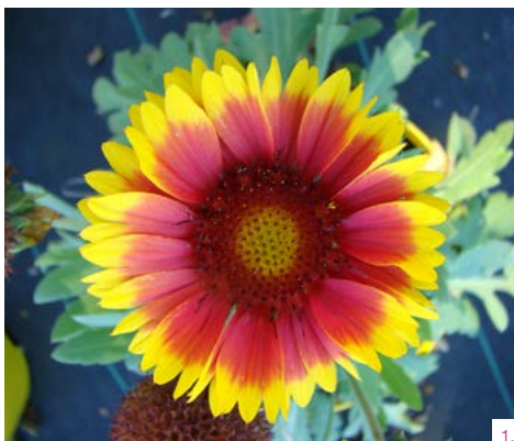
1. Gaillardia Kobold 2. Alstroemeria Indian Summer 3. Hibiscus moscheutos